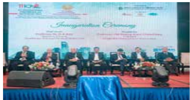
Inauguration ceremony of the 11th ICP and 13th SAARC international psychiatric conference 2022

The 11th International Conference of Psychiatry in Bangladesh and the 13th South Asian Association for Regional Cooperation (SAARC) International Psychiatry Conference, took place in Radisson Blu Bayview, Chattogram, Bangladesh, 29-30 September 2022. SAARC has eight countries, including Afghanistan, Bangladesh, Bhutan, India, Maldives, Nepal, Pakistan, and Sri Lanka.