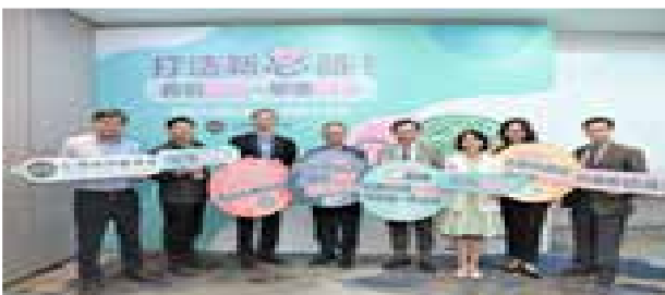
A press conference “New Tactics for Treating Patients with Schizophrenia,” 28 July, 2022

The press conference also highlighted effective ways to maintain the treatment of mental illnesses using long-acting injection therapy with antipsychotic drugs and emphasised on communicating mental health information to the public and de-stigmatize mental illnesses.