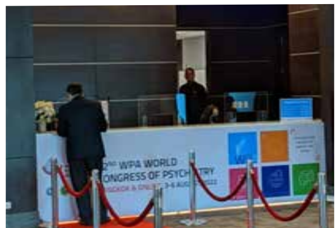
Registration area of the 22nd WPA World Congress of Psychiatry, in Bangkok, Thailand

The Psychiatric Association of Thailand is delighted about the success of the 22nd WPA World Congress of Psychiatry in Bangkok on 3-6 August, 2022. This hybrid congress provided us with great experience and an excellent opportunity to meet mental health experts from around the world.