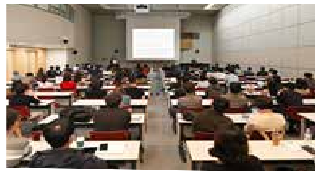
A photo taken at the KNPA fall congress

Since the COVID pandemic situation had been controlled in some extent, the KNPA offered an in-person congress after few years of on-line and hybrid congresses. The theme of this event was "Psychiatry, for happy life and healthy world." At the congress, we covered topics from basic neural science and psychotherapy to digital therapy for mental illnesses and recent social problems in Korea.