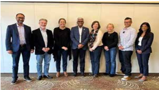
A group photo of RANZCP board members at the New Zealand conference