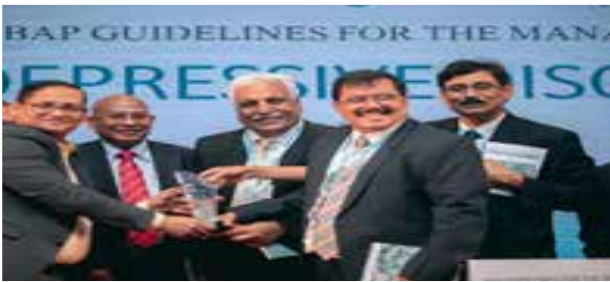
Crest giving ceremony at the launching ceremony of BAP guidelines for the management of depressive disorders

The event was further complemented by launching of the two national guidelines, BAP guidelines for the management of depressive disorders and BAP guidelines for the management of anxiety disorders. A part of the conference was also recognizing young talented psychiatrists as well as honoring the legends of psychiatry in Bangladesh. SPF fellowship award, gold medal award for recognizing young talented psychiatrists in Bangladesh, research grant award for psychiatric trainees and students, best poster presentation award, lifetime achievement award, posthumous award and outstanding contribution in the conference award were among the many awards given. The congress had other events as well, including inauguration ceremony to welcome the delegates, a grand cultural night full of music, dance and entertainment shows and exciting raffle draws. (The author declares no potential conflicts of interest in writing this report.)