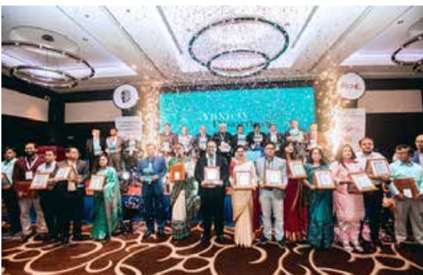
Launching ceremony of the BAP guidelines for the management of anxiety disorders