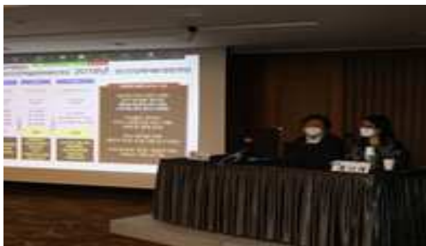
A photo of a symposium during the fall congress in Busan

Numerous symposia were prepared to introduce and draw dynamic discussion on "Current research state on developing digital therapeutics" and "The development and validation of advanced convergence medical technologies in the field of psychiatry."