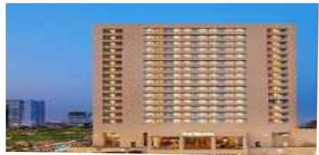
The Westin Hyderabad Mindspace Hotel

Please check the website at www.wcap.co.in for registration and for your information for viewing the preliminary program when available. Come and join us for an incredible psychiatric Congress in India.