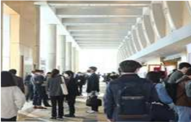
KNPA members participating in the annual spring congress

Totally, 1,374 participants gathered together with joy and exchanged opinions. Winners were invited to present at this congress as well as receiving a memento of their academic achievement.