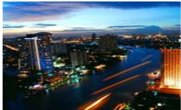
Bangkok night along the Chao Phraya River

We look forward to welcoming everyone to Thailand. (The authors declare no conflicts of interest in announcing this news.)