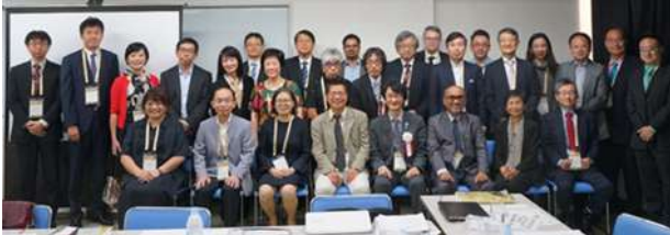
A photo at the AsCNP board meeting