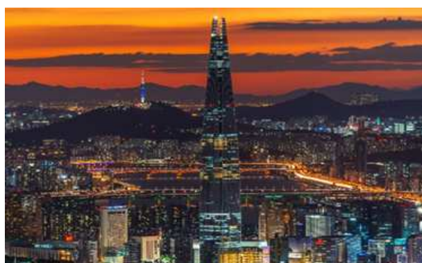
Seoul Skyscraper (with 555 Metres)