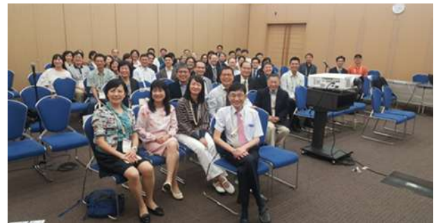
A group photo at the 2019 TSBPN-AsCNP Joint Symposium

The TSBPN comprises the local organising committee and now is preparing and assisting the International College of Neuropsychopharmacology (CINP) in organising the CINP World Congress 2020 in Taipei, Taiwan. 25-28 June, 2020 This is a great honour and chance for us to introduce the beauty of Taiwan to each attendee. You are extremely welcome to join us at this world congress. We are looking forward to meeting you in Taiwan in 2020! (The authors declare no conflicts of interest in writing this feature.)