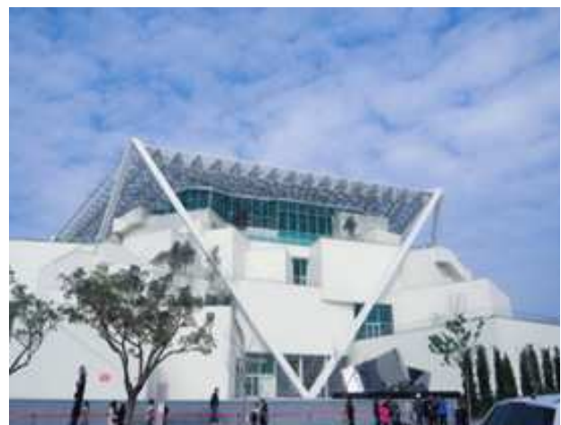
A photo taken at the Tainan Art Museum, which opened on 2019.1, Tainan.

To the new friends, we are confident to say, Tainan is the ancient city of Taiwan, and also known as the capital of tasty food. A half-day city tour is arranged to bring the participants an in-depth cultural, historical and delicious food experience of Tainan. To the old friends, bring your best memory here and come to see us and beautiful Tainan City again! (The authors declare no conflicts of interest in writing this feature.)