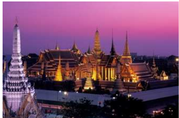
The temple of the Emerald Buddha (Wat Phra Kaew)