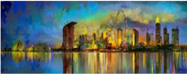
Coastal sky line of Singapore

A call for symposia will be announced in 2020. On behalf of the local organising committee, we are pleased to invite you to submit symposium proposals aligned with the theme of the congress.