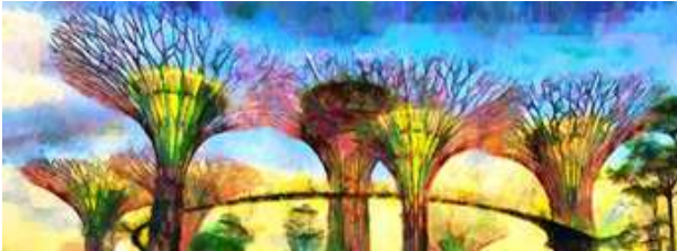
Super tree of Singapore