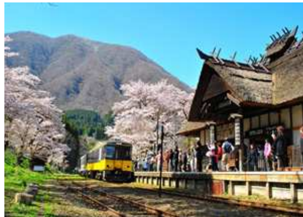
Spring landscape at Yunokami Onsen Station