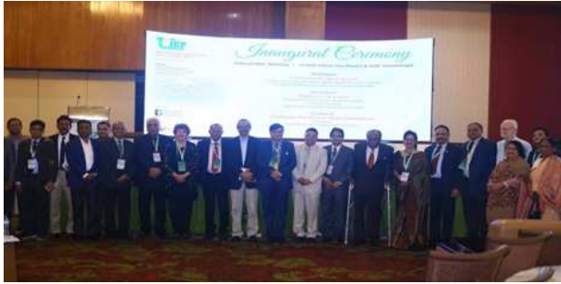
A photo at anugural ceremony of International conference of Bangladesh

The award ceremony with special speeches was also held during the 10th ICP, 2019. The 3rd “Professor Hidayetul Islam Gold Medal Award” was as a best promising young psychiatrist. The first Professor Md Waziul Alam Chowdhury Research Grant Award was also given in this event. (The author declares no conflicts of interest in writing this report.)