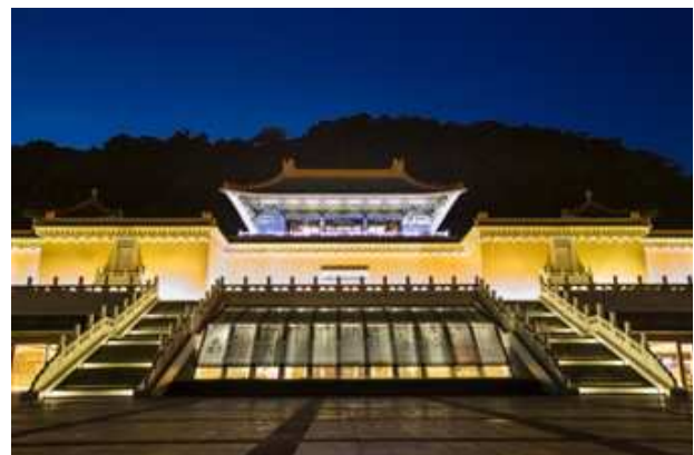
The National Palace Museum in Taipei

With its own style and charm, Taipei is an amazing modern city with an innumerable amount of historical attractions, especially the National Palace Museum, numerous acclaimed night markets, shopping districts, as well as cultural amenities like modern coffee houses, museums, and fantastic nightlife at www.guidetotaipei.com . We hope to see you at the next CINP World Congress 2020 in Taipei, Taiwan. We guarantee that you will have an unforgettable memory for your stay in Taipei!