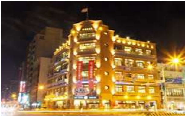
A photo taken at Hayashi Department Store, which opened in 1932, Tainan