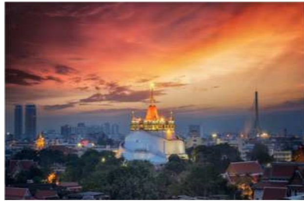
The Golden Mount temple (Wat Saket)

We look forward to seeing you in Bangkok in October 2020. (The authors declare no potential conflict of interest in writing this announcement.)