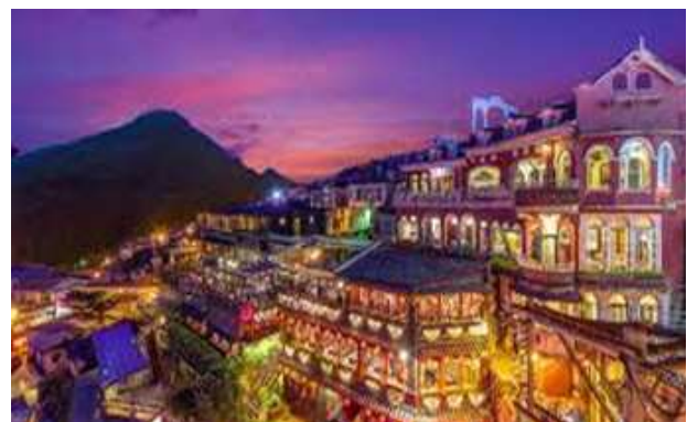
Jiufen and Jinguashi: Taiwan's Golden Getaways