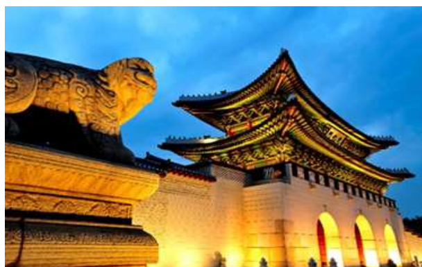
Haechi and Gwanghwamun Gate

We are confident that PRCP 2021 will bring innovation and further advancement to the scientific level and quality of the field of psychiatry, and extend our heartfelt invitation to you to join us at PRCP 2021 in Seoul. We will keep bring the information of the IC of the PRCP 2021 up to date to you in the future issues of the Bulletin of the AFPA. (The author declares no conflicts of interest in writing this announcement.)