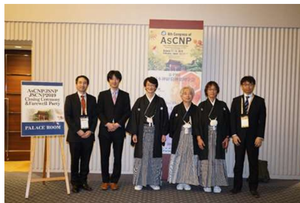
A photo of AsCNP/JSNP/JSCNP 2019 chairs and secretaries