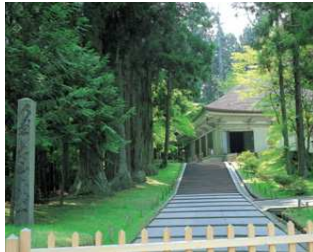
Chuson-ji Temple: a world heritage site

annual meeting to serve as a signpost for the future of mental health care and psychiatry in Japan. I look forward to seeing you all in Sendai for our JSPN annual meeting. (The author declares no conflicts of interest in writing this announcement.)