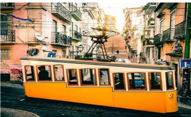
A traditional Lisbon tram