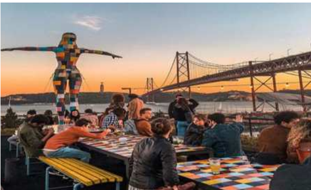
Lisbon's thriving social life, overlooking River Tejo

Taking place in the summer, in one of the most astounding and heart-warming countries in Europe and granting a programme filled with valuable knowledge and contributions from the best in the field, this year's WCP will surely be an event to attend. (The authors declare no conflicts of interest.)