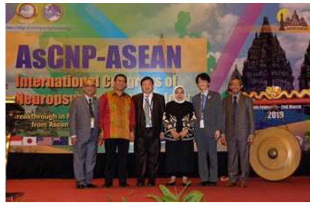
A photo taken at the opening ceremony

The Bulletin of the AFPA © 2019 The Asian Federation of Psychiatric Associations®