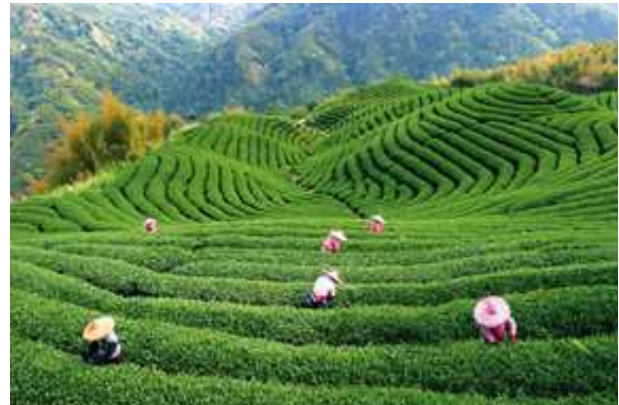
Tea garden in Srimongal

Please join the 10th ICP for an exciting and learning experience in December 2019 in Srimongal, Bangladesh. (The author declares no potential conflicts of interest besides promoting the attendance.)