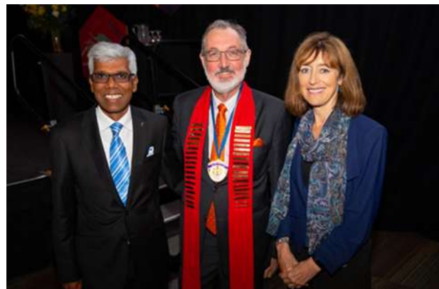
A photo from RANZCP Congress, May 2019.

We invite you to join us at next year's Congress with a theme of 'Influencing and being influenced by the world around us'. Save the date for 17–21 May 2020, in Hobart, Australia. (The author declares no conflicts of interest.)