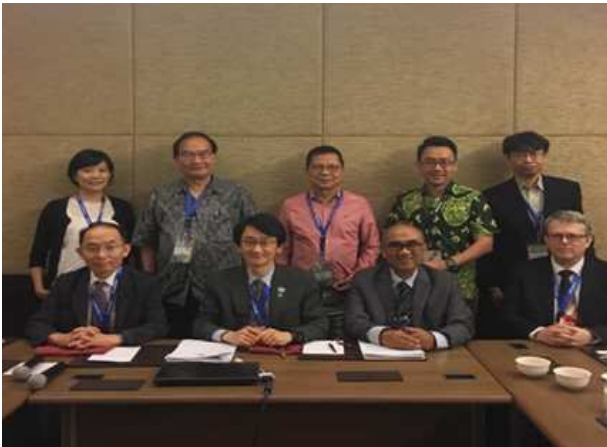
A photo taken after the council meeting of Asian College of Neuropsychopharmacology

in exchanging and to promoting our innovative knowledge in the neuropsychopharmacology field among of all attendances especially members of colleges. Following the great success of the AsCNP-ASEAN 2019 International Congress, we hope that we can reach out the new insights towards understanding in neuropsychopharmacology field in South-East Asia. (The author declares no conflicts of interest in writing this feature.)