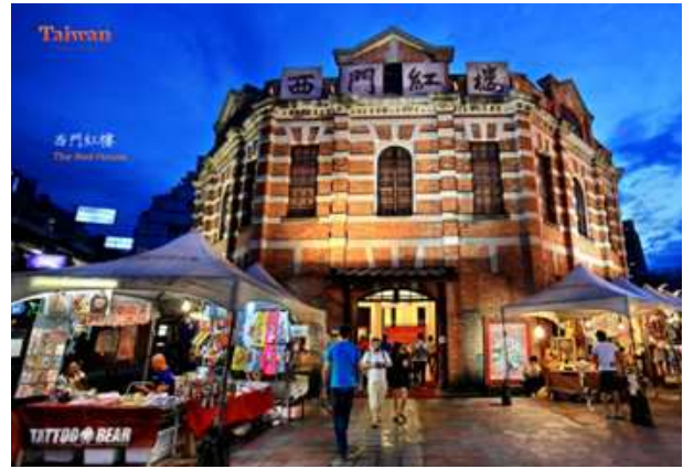
A historic market place in downtown Taipei