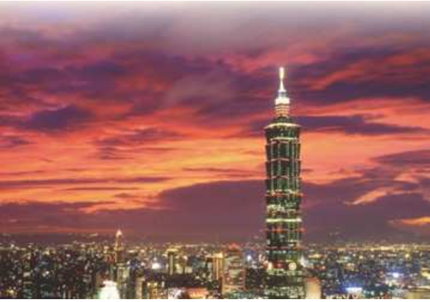
Taipei 101, used to be the highest building in the world