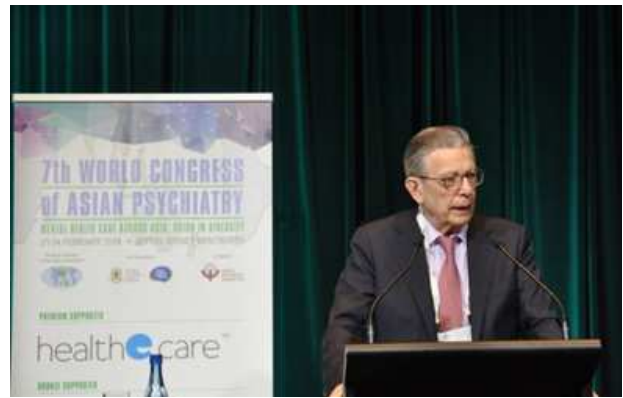
Norman Sartorius (Switzerland)