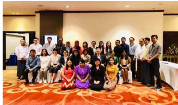
Photo 1. A group photo of pre-congress workshop on leadership and professional development training, 25 October, 2018)

(2), and India (1). Out of total 26 participants, 17 psychiatrists were from the host country, Myanmar.