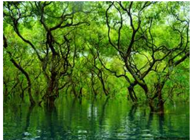
Ratargul swamp forest in Sylhet