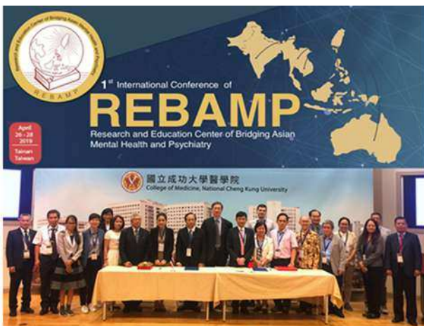
A group photo of delegates of the first IC of REBAMP at National Cheng Kung University, Tainan, Taiwan.

All participants showed the passion of international interaction and it will be a wonderful academic collaboration through the REBAMP in the future. (The authors report no conflicts of interest.)