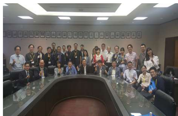
A group photo taken after the 2018 WFSBP-TSBPN Joint Annual Symposium at Kobe Chamber of Commerce and Industry, 8 September, 2018.

At the Kobe Congress, we invited seven Taiwanese researchers to present their state-of-art studies and exchange prestigious experiences with local and foreign colleagues. Unfortunately, the Super Typhoon Jebi destroyed Kansai Airport severely and disrupted all the flights from Taiwan. Many enthusiastic attendees changed their flights and landed at various Japanese airports - Haneda, Nagoya, Takamatsu, Fukuoka, and so on, (one even at Chitose in Hokkaido), but we were all heading for the same destination for Kobe. Finally, more than 40 Taiwan participants arrived at the venue safely and attended the Taiwan Symposium 8 September, 2018, accommodated by WFSBP Asia-Pacific Congress, Kobe, 6-9 September, 2018. (The author declares no conflicts in writing this report.)