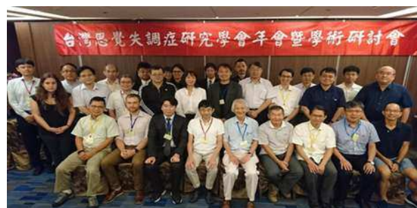
A photo taken at the 2018 annual symposium of Taiwanese Society of Schizophrenia Research at Beitou, Taipei

The conference has successfully brought together the academic and clinical researchers in schizophrenia research, and provided excellent chances for young researchers to build up their early experience presenting their works in domestic and international conferences in our neighbouring nations in Asia. In April 2019, we plan to hold a symposium in the first conference of Research and Education Center of Bridging Asian Mental Health and Psychiatry (REBAMP), Tainan, Taiwan to further promote the research connection with Asian countries and to encourage young psychiatrists and researchers to participate and to contribute. (The authors declare no conflicts of interest in writing this report.)