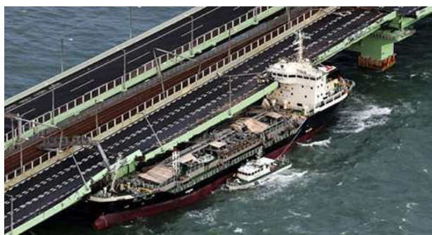
A tanker crashed the bridge connecting Kansai Airport, 4 September, 2018

disaster, Hokkaido Earthquake also happened on 6 September with Mj 6.7/ Mw 6.6, causing 41 dead, 749 injured, and 2,000 houses broken. Due to the blackout through whole Hokkaido Area, daily life of the people in this area were severely affected and some expected participants from Hokkaido could not come to the