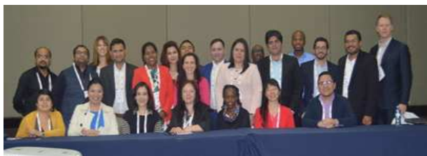
A group photo of early career psychiatrists taken at the International Congress of the WPA in Mexico City, September 27-30, 2018

The first mandate year of the board which started in the 2017 WPA Congress in Berlin, has passed by. The year was full of exciting activities, networking, hard work, but also fun. We are happy and proud for all we have done so far, and looking forward to the exciting years ahead. Establishing international and interdisciplinary collaboration, making scientific research, organising expert events, delivering information, learning from each other, helping our members - especially when it comes to learning and working possibilities, as well as position of trainees and young psychiatrists worldwide... But the far most satisfying has been having the opportunity to see the section of the ECPs grow, colleagues from all over the world share their experiences, help each other, and work together.