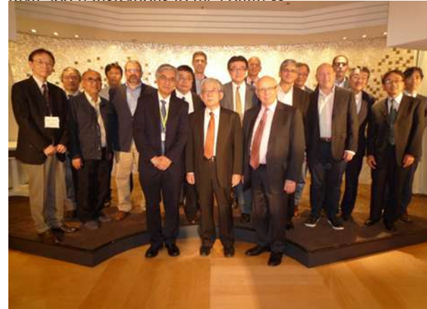
A photo at the presidential dinner at Kobe Club