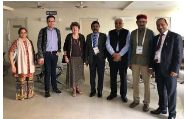
A photo taken at the Hyderabad International Meeting, 28 November, 2018.